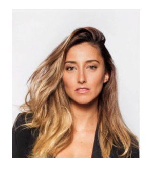
Episode 7 - MEXICO